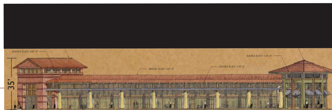
Belvedere Road Endcap-Suite 805 Piazza Endcap-Suite 801