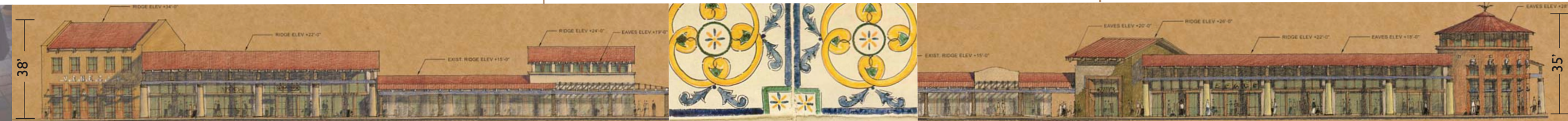
Piazza Endcap-Suite 705 Suite 703 Suite 701 Pasta Pomodoro Endcap Starbucks North Entry Suite 401 Southerly Rotunda